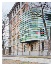
Fire-and Police Station